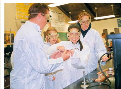
TAKE AP CLASSES