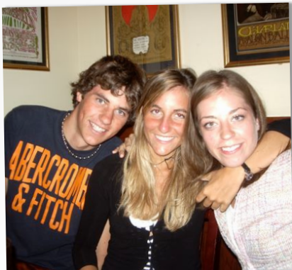
STUDY WITH OTHER INTERNATIONAL STUDENTS

preparatory high school with a U.S. high school diploma. During the year of English and academic training, ECI will help the student to apply to and gain acceptance to a U.S. university.