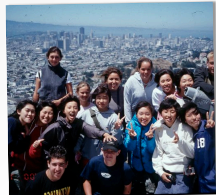
ACTIVITIES ON WEEKENDS