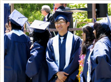
GRADUATE FROM U.S. HIGH SCHOOL